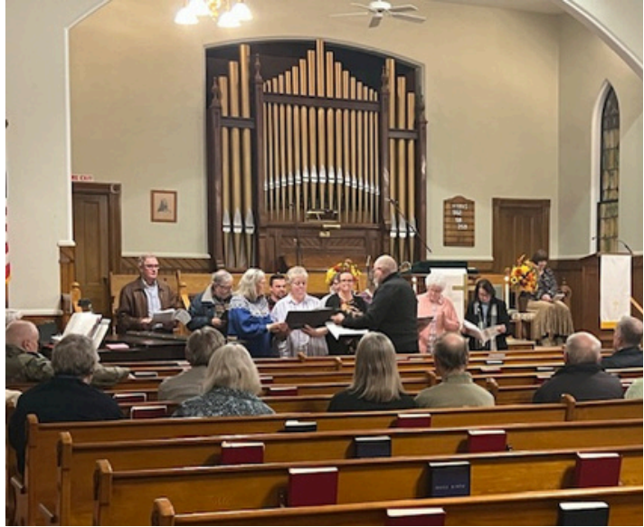
The WBC Choir and a few of our own.